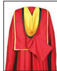
DOCTOR OF PHILOSOPHY