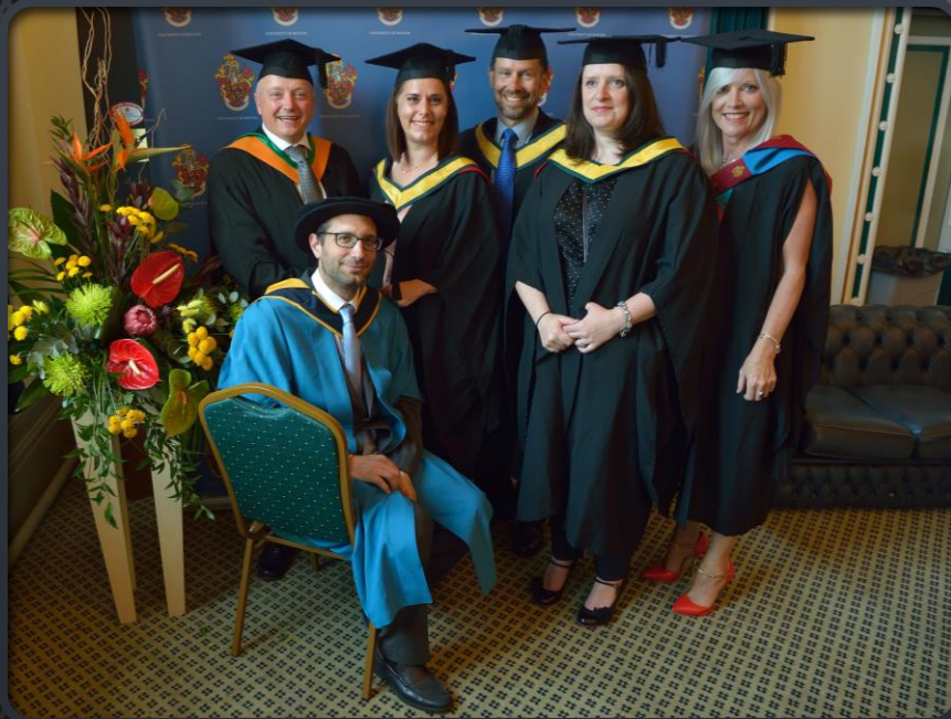
Dental Technology Academic Team 2020