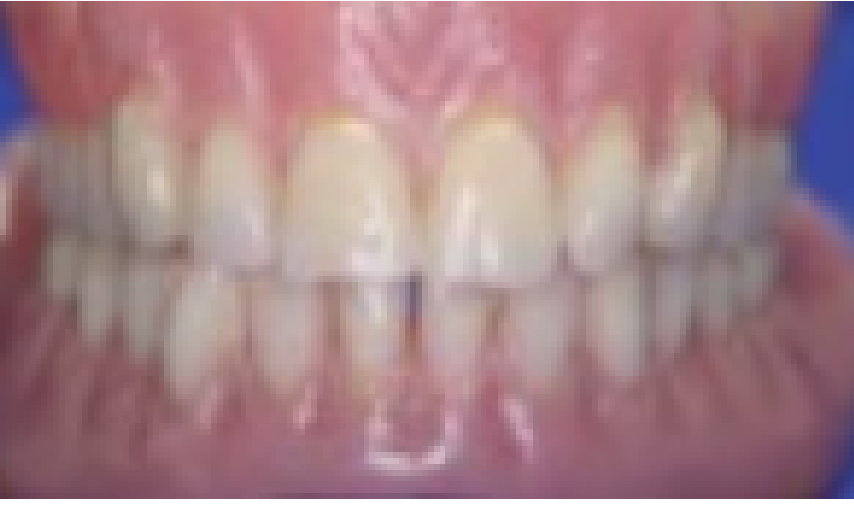
Fig. 7 Completed

* The appliance shown in each stage has to be similar (not necessarily the same). However, it must <u>always</u> be the same type of appliance, e.g. lower removable polymeric partial prosthodontic custom made device