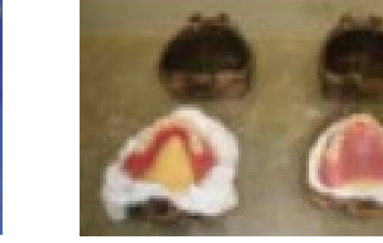
Fig.3 Teeth set-up