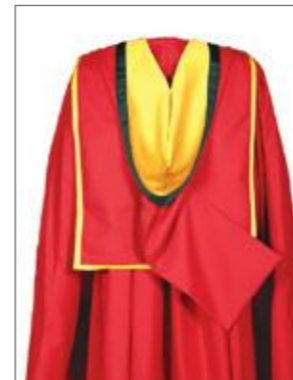
DOCTOR OF PHILOSOPHY