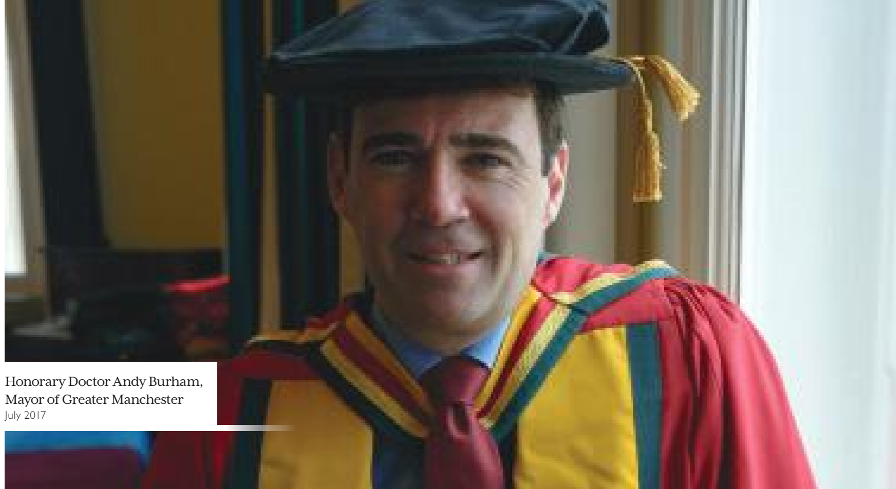
Honorary Doctor Andy Burham, Mayor of Greater Manchester July 2017