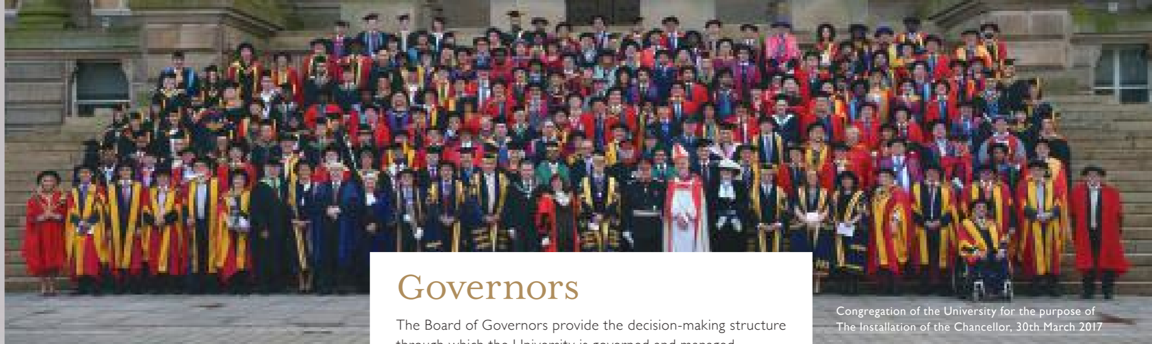
Congregation of the University for the purpose of The Installation of the Chancellor, 30th March 2017

The Chancellor and Pro Chancellor wear a medal identical to the boss at the head of the mace, also engraved with the Coat of Arms of the University of Bolton. This is a symbol of the authority and status of their office and that of the university.